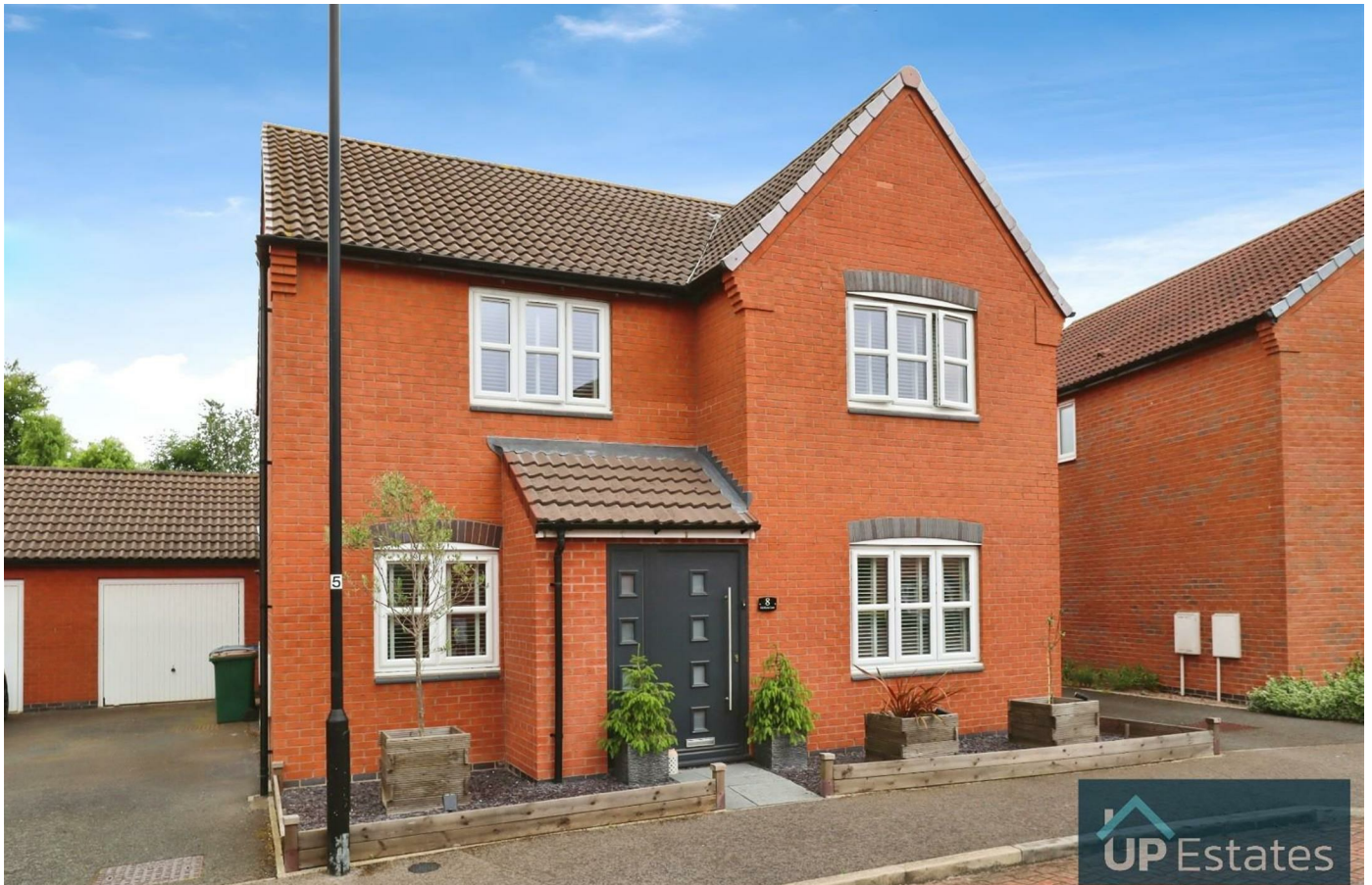
Old Farm Lane, Longford, Coventry